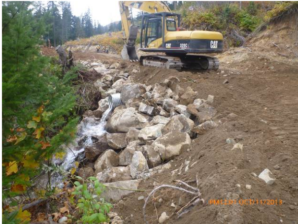
Photo 1. Finalizing the culvert replacement at Stn. 1+160 (Oct 11, 2013).