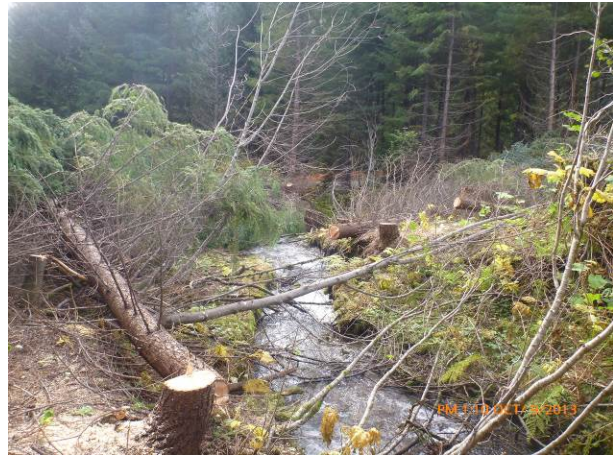
Photo 6. Conditions within stream 9 RVMA following hand clearing. No trees were felled into the watercourse. (Oct. 9, 2013).