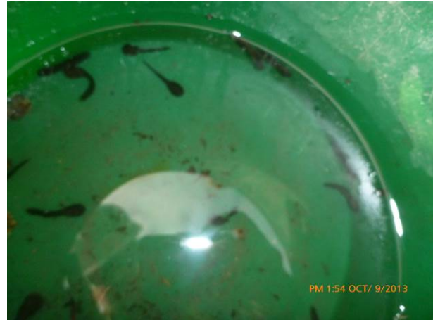
Photo 2. Coastal Tailed Frog tadpoles captured and relocated to suitable upstream habitat within the Stn. 1+160 watercourse (Oct 9, 2013).