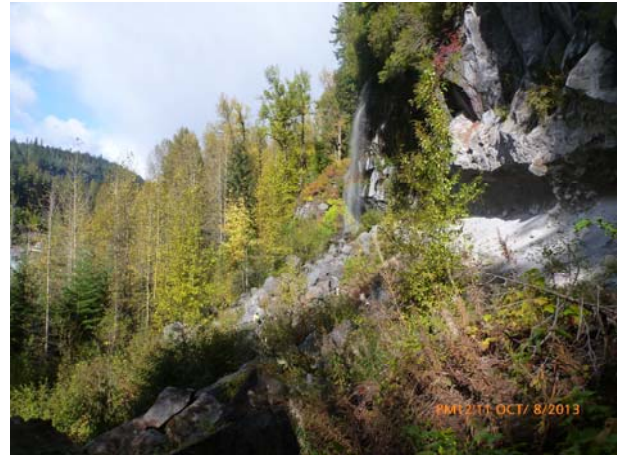
Photo 4. Looking towards the waterfall above first watercourse crossing along the trail alignment. (Oct 8, 2013).