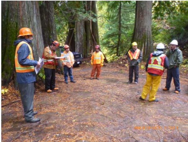
Photo 3. Truckwash Creek Trail pre-construction meeting (Oct 7, 2013).