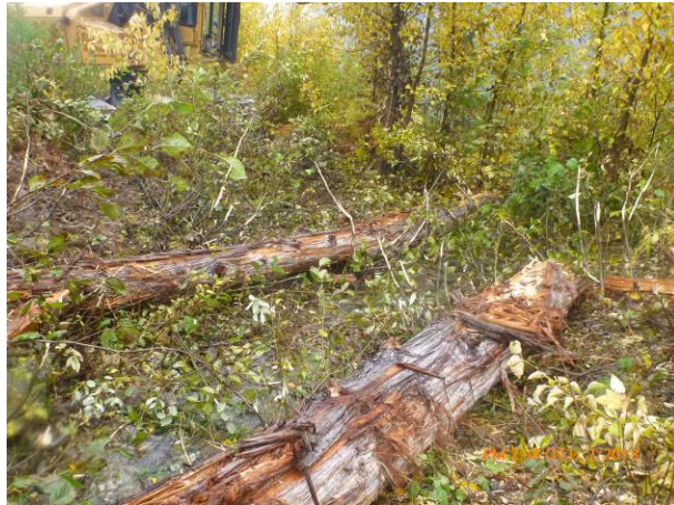
Photo 5. One example of a temporary crossing installed by the feller buncher to cross an open channel without impacting the stream banks or substrate (Oct. 7, 2013).