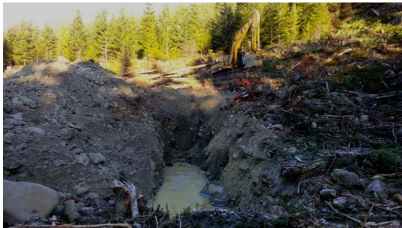
Photo 5. Test trench at the BDRHEF powerhouse location (Dec 3, 2013).