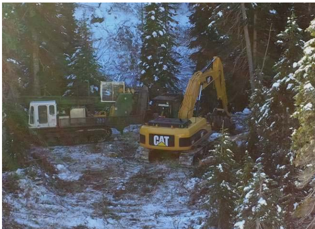
Photo 1. Excavator and drilling equipment operation on the north (left) bank on the ULRHEF intake (Dec 3, 2013).