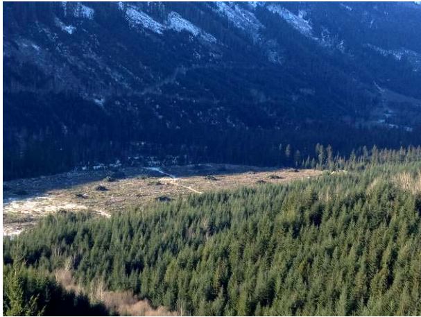
Photo 3. Piles of trees within the future construction camp location (Dec 7, 2013).