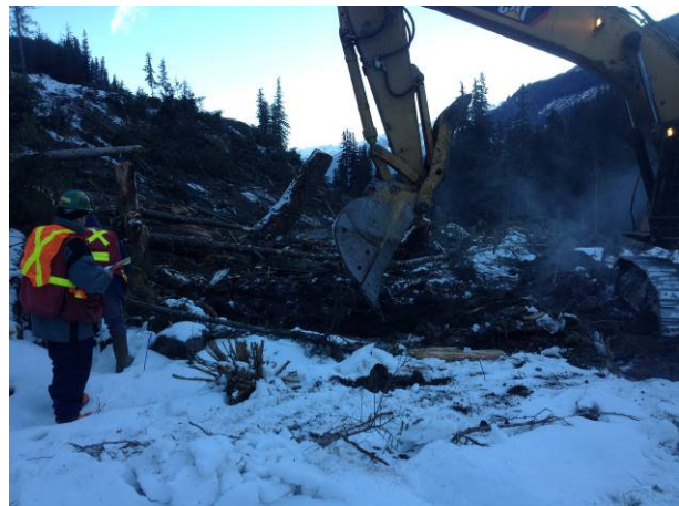
Photo 2. Test pitting at the ULRHEF powerhouse within 50m of the identified archeological site, in the presence of the archeology monitor (Dec 6, 2013).