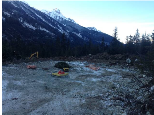
Photo 4. Grubbing began at the future construction camp location (Dec 7, 2013).