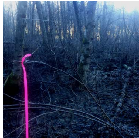
Photo 7. Transect location flagged within the MWRFMZ (Dec 4, 2013).