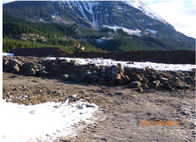
Photo 1. Overview of grubbing activities completed at the future construction camp location (Dec 18, 2013).