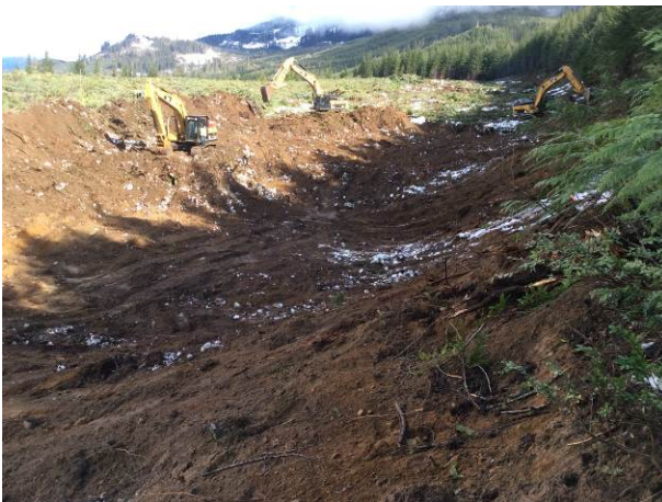
Photo 1. Stripping and grubbing of the Construction Camp work area. (April 25, 2013).