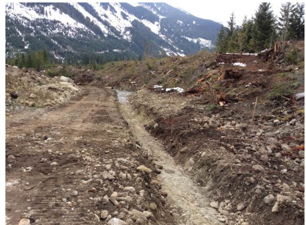
Photo 2. Road side drainage installation at the BDRHEF powerhouse location. (April 26, 2013).