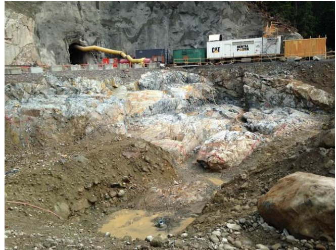
Photo 2. Dewatering of seepage from within the powerhouse excavation was pumped to the sediment ponds. Water has not yet reached the second treatment pond (August 15, 2014).