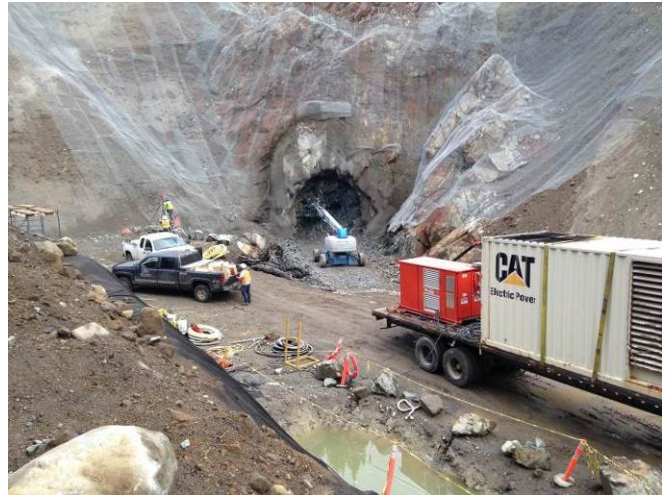
Photo 4. Tunnel stabilization activities at the ULR downstream portal. (August 15, 2014).