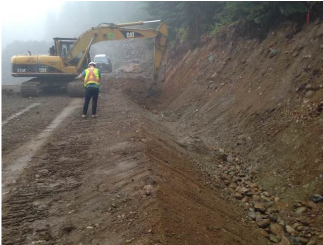
Photo 1. Ditching and slope stabilization along the new Boulder Intake access road following prescription outlined in the work plan. (August 15, 2014).