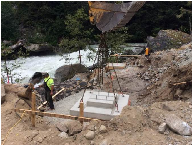
Photo 5. Placement of Ryan River bridge footing (August 12, 2014).