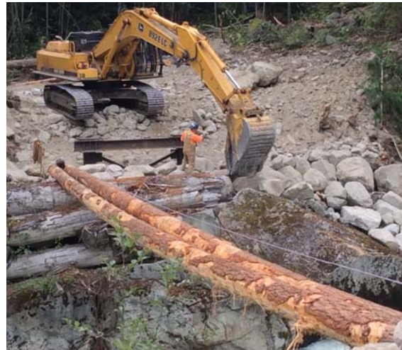
Photo 6. Riprap placement adjacent to the Ryan River (August 14, 2014).