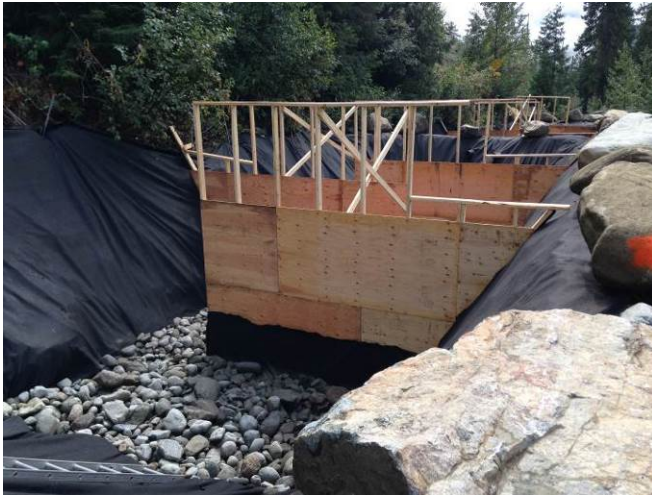
Photo 3. Constructed sediment ponds to be used for treatment of seepage water emanating from the ULRHEF downstream tunnel portal. (August 15, 2014).