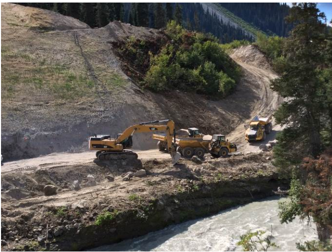
Photo 3. ULRHEF intake diversion channel excavation adjacent to the Lillooet River. (August 21, 2014).