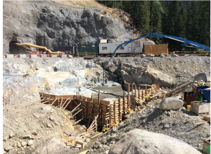
Photo 2. Concrete mud slab pour. Dewatering of seepage from within the forms was pumped to the sediment ponds. Water has not yet reached the third treatment pond (August 20, 2014).