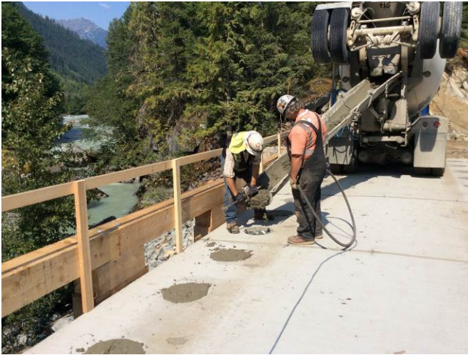
Photo 5. Grouting of Ryan River bridge deck panels (August 22, 2014).