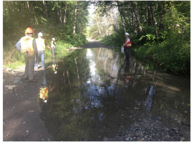
Photo 6. Flooded section of the South Lillooet River FSR containing fish. (August 20, 2014).