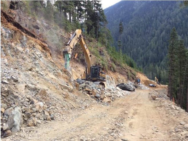
Photo 1. Completing slope stabilization along the new Boulder Intake access road following prescription outlined in the work plan. (August 21, 2014).