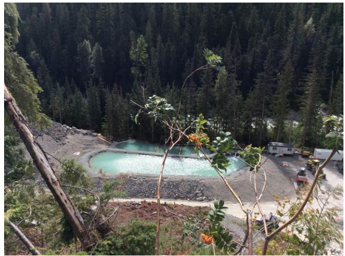
Photo 4. Conditions of the ULR HEF powerhouse sediment ponds. (August 20, 2014).